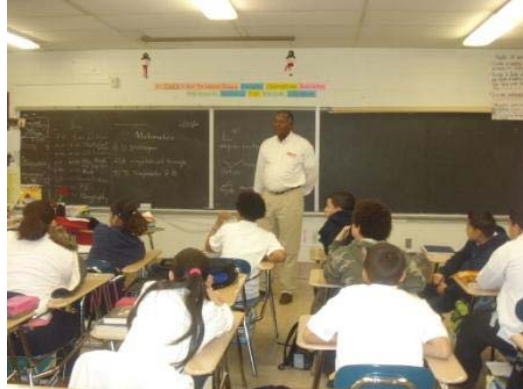
Professionals in the community enlightened students about their vocations during Career day.